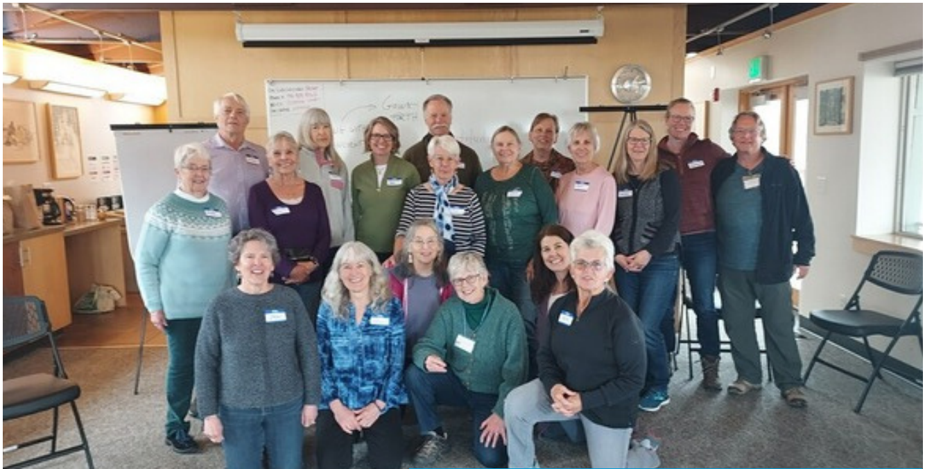
2023 Active Hope Retreat

April is also the Easter/Earth Day season so we additionally a) hosted the film: “The Letter”, b) announced our partnership with local organization Trees, Water and People, and c) worked with the Music Ministry on our first Earth Day Pick-Up Choir!