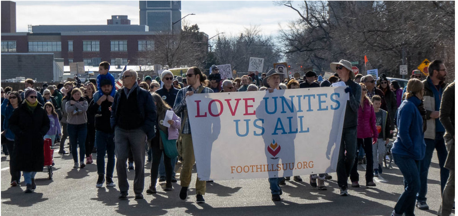
2023 MLK March