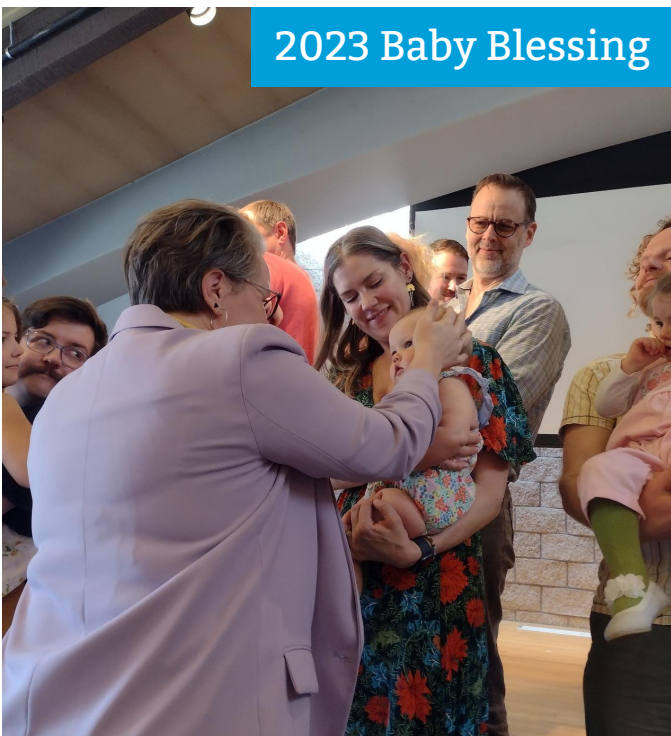
2023 Baby Blessing