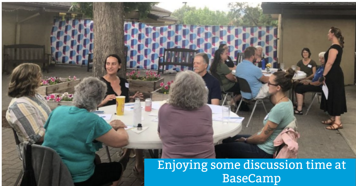
Enjoying some discussion time at BaseCamp

We can't wait to welcome all of our newest members in a Welcome Ceremony at our 9:30 AM service on June 4 (also our annual Flower ceremony!)