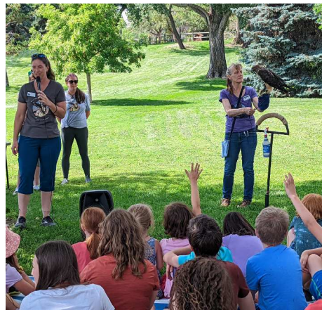
The Rocky Mountain Raptor Program visit summer camp! August 2022