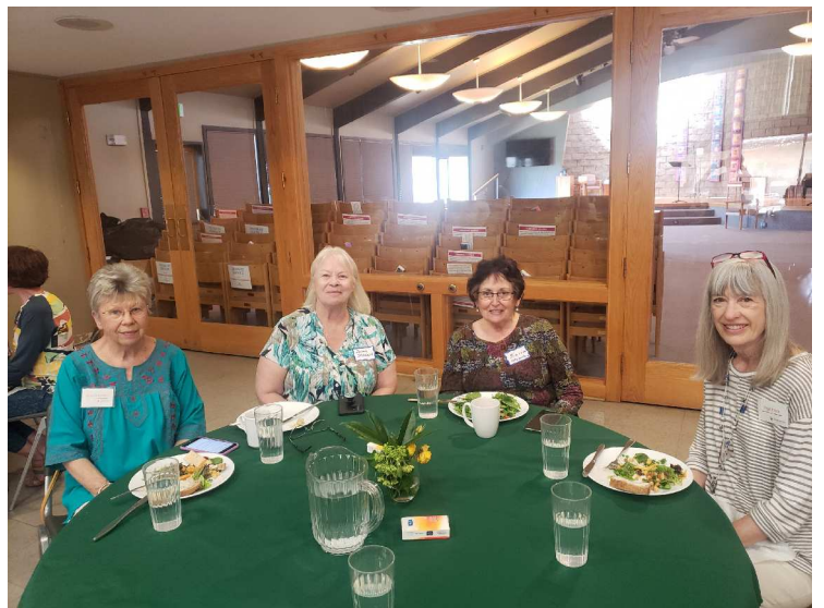
Ladies 50 and better gather for a Slightly Senior Sisterhood lunch in the church social hall.