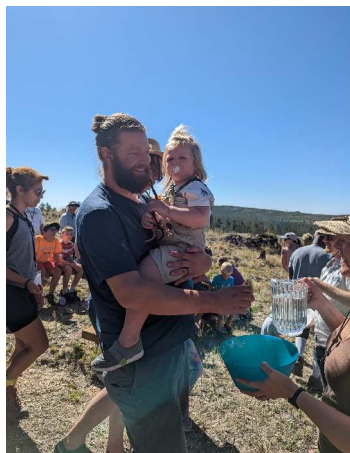
Buckhorn Family Retreat September 2022