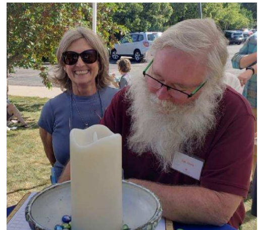
New Member Book Signing & Celebration August 2022