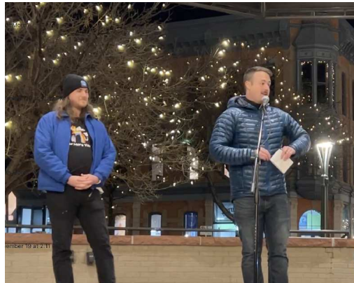
Foothills Unitarian co-hosted a vigil in Old Town Square following the Club Q shooting and for Trans Day of Remembrance.