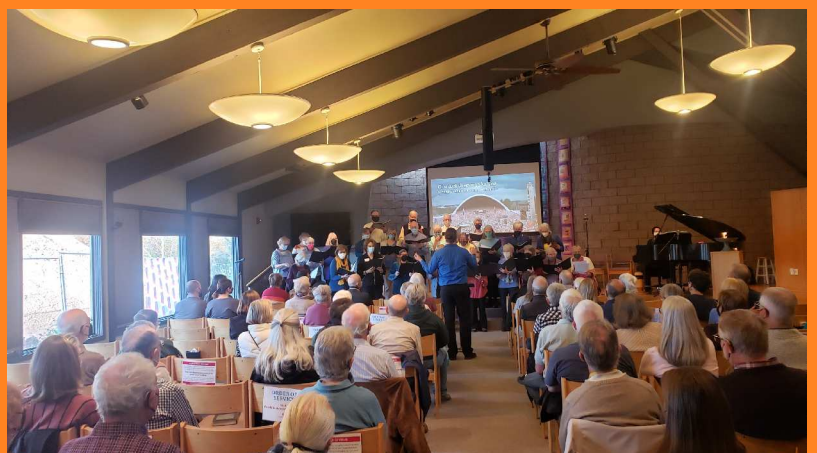
Choir performs at Sunday service.