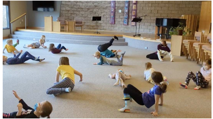
Spring Break Creative Dance Camp March 2022