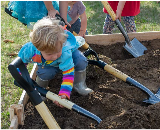
Building Expansion Groundbreaking May 2022