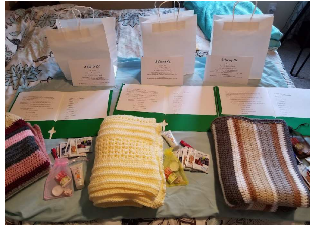
We delivered 29 Caring Kits in 2022.