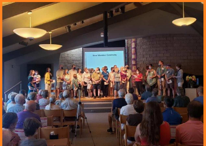
In August, 24 new members signed the membership book and were celebrated during church and at coffee hour!