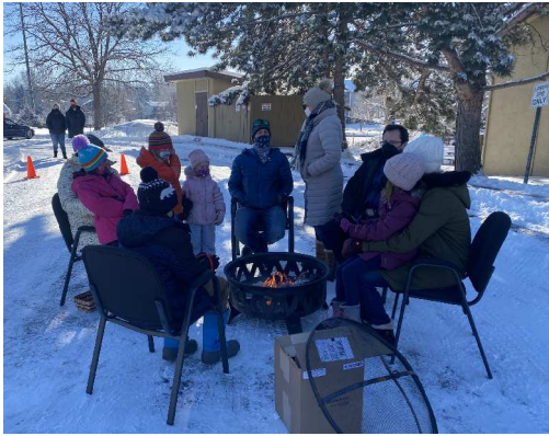
Fire Communion January 2022