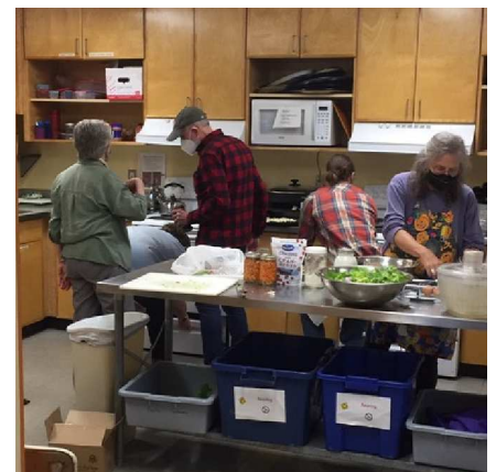
Preparing a "Seasonal Supper" community meal

Over 100 people participated in Climate Justice Ministry in 2022.