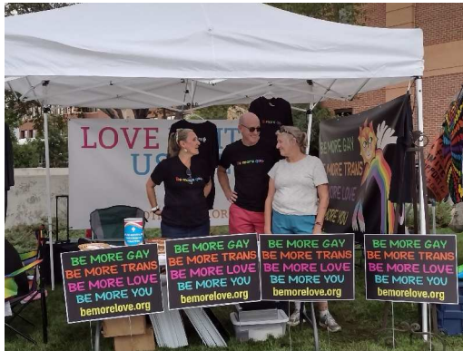
We co-sponsored Fort Collins Pride in the Park 2022.

raised to support LGBT+ inclusive programming at UU Grand Valley, a congregation on the conservative western slope.