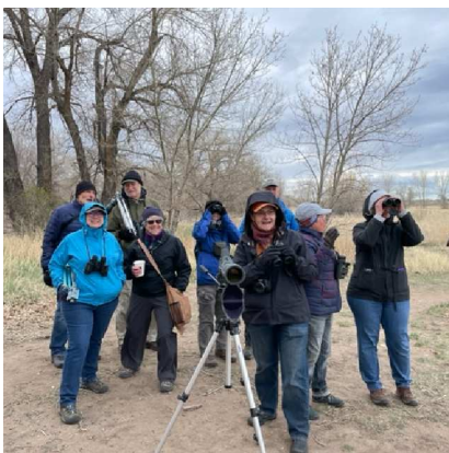
Earth Day Birding and Bagels Event

In 2023, we are planning a party for New Year Regeneration Resolutions for the whole congregation and a "Next Step" gathering for the nearly 40 people signed up for Green Sanctuary Newsletter. For Earth Day weekend, a workshop is planned based on Joanna Macy's book "Active Hope: How to Face the Mess We're in with Unexpected Resilience & Creative Power" with an outside trainer. We will partner with the BIPOC Alliance on a book discussion before that weekend and on offering scholarships for the workshop. Finally, we plan to team up with the Coalition for the Poudre River Watershed and get a Foothills Forest Restoration Team on the ground in May.