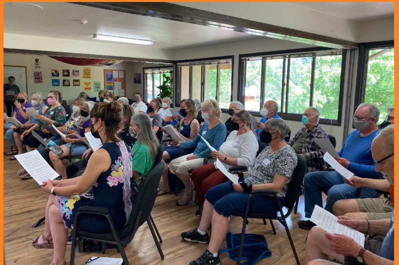
Choir restarted in summer 2022.