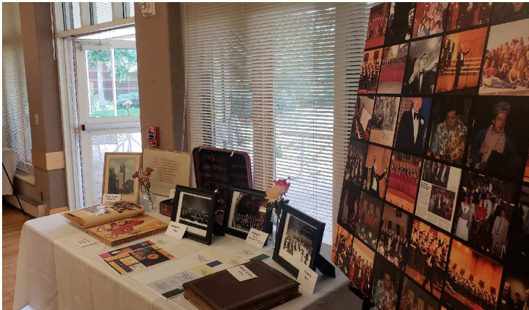
Memory Table set up by our Memorial Team.

14 people participated in our Tangled Blessings grief group.