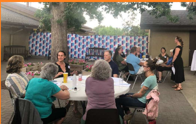
Newcomers participate in our one-day July BaseCamp retreat.

folks joined us for our September connections dinner where newcomers have a chance to connect with long-time members over a meal.