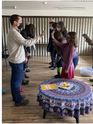
First indoor in-person Sunday of the year February 2022