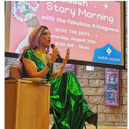
44 community members joined us for our first Drag Story Hour!

“ We all have something that makes us different, freaky, and non-conforming. Difference is the universal human truth. Discovering what makes us different and embracing our uniqueness in everyday life makes us truly free. Now is the time to shave your head, and get that tattoo, and get that extra piercing. Now is the time to be yourself in the most particular ways you can and to celebrate the ways that others are themselves in the most particular ways they are. So whatever queer you've got today, bring it all. Especially if you have the privilege to pass, choose not to. And if you aren't queer yourself, let this be an invitation to hold the sign that says be more gay wherever you might run into a queer person wondering if who they are is compatible with being loved. Be willing to stand out and make things a little less comfortable for yourself not just for the sake of those kids in Texas or for those families in Florida, but for us all.