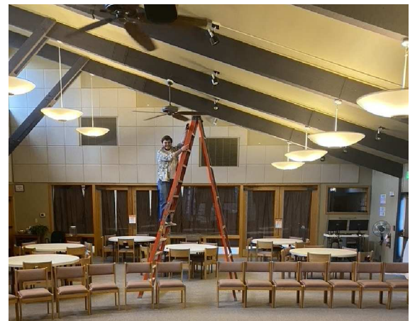
Tanner Linden sets up cameras for improved live-streaming services September 2022