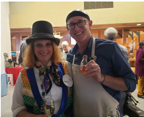
Auction September 2022